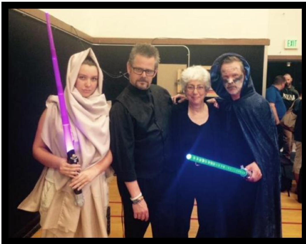
Jedi Rey and The Dark Lord had an epiclightsaber battle at the annual Eastside Band Festival as the Casa bandperformed John Williams' Star Wars Theme .