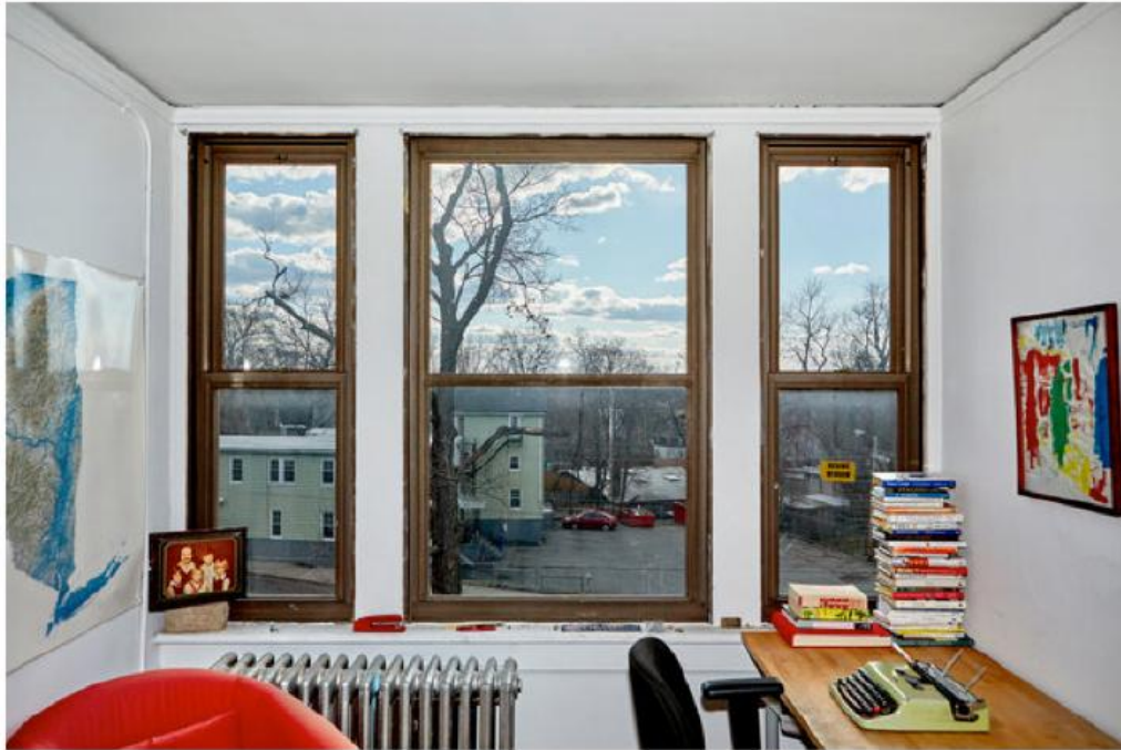
An image from "Letter of Recommendation: Looking Out the Window," one of the 18 pieces on our list.