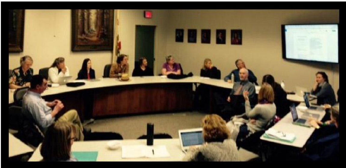
Secondary science teachers from throughout Petaluma City Schools met recently to plan for district-wide implementation of the new Next Generation Science Standards .