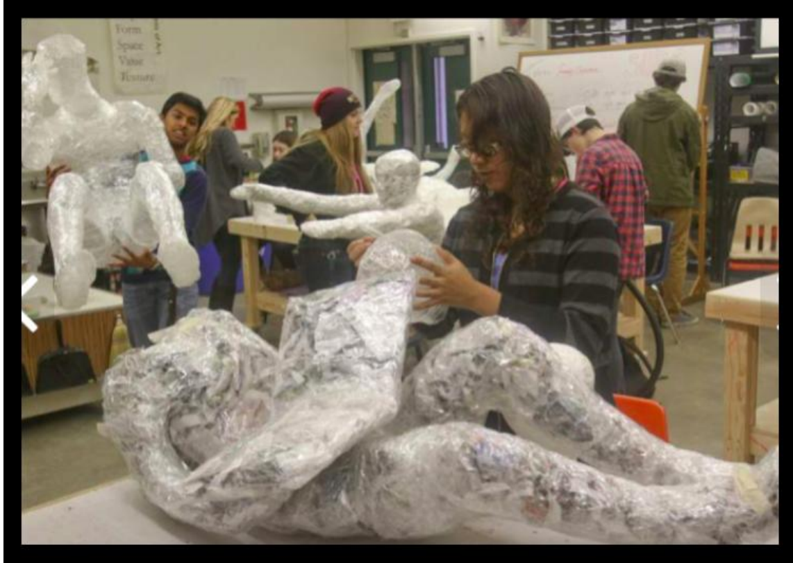
Makerspace at Casa Grande