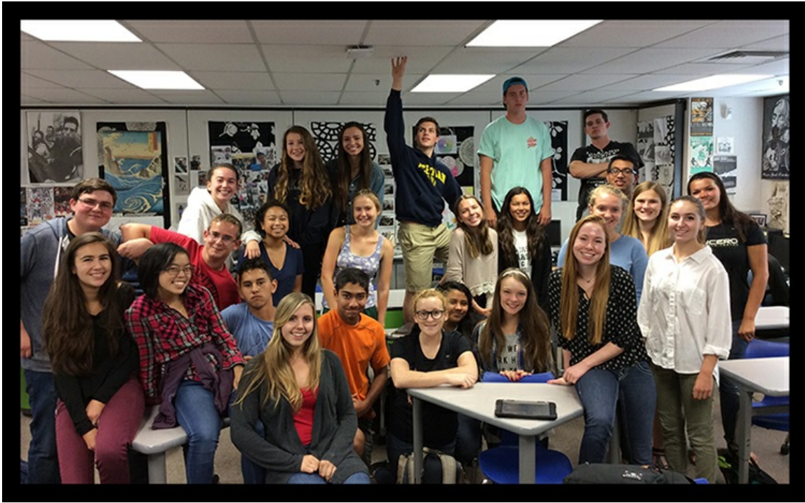
The 2015-16 Gazette staff

The Gaucho Gazette , Casa Grande's student newspaper, is a finalist for the 2015 Newspaper Pacemaker award given by the National Scholastic Press Association. The award is the highest national honor for journalism students and has been considered the Pulitzer Prize of student journalism since its inception in 1927. The Gaucho Gazette has won myriad honors at The Press Democrat's annual high school journalism awards ceremony--everything from Best Layout and Design, Best Sports Writing, Best Features Writing, Best Investigative Reporting, and Overall Champion-- for 10+ years. Gaucho Gazette alumni have gone on to study at some of the best universities in the country, including all ten University of California campuses, Harvard, Barnard, Cornell, and Northeastern.